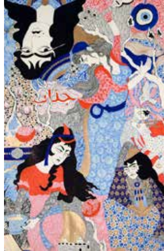
Mona Danesh "Jazzab"