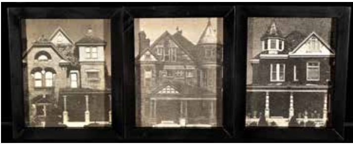
Kate Berkemeyer "Light Houses" (Series of 3)