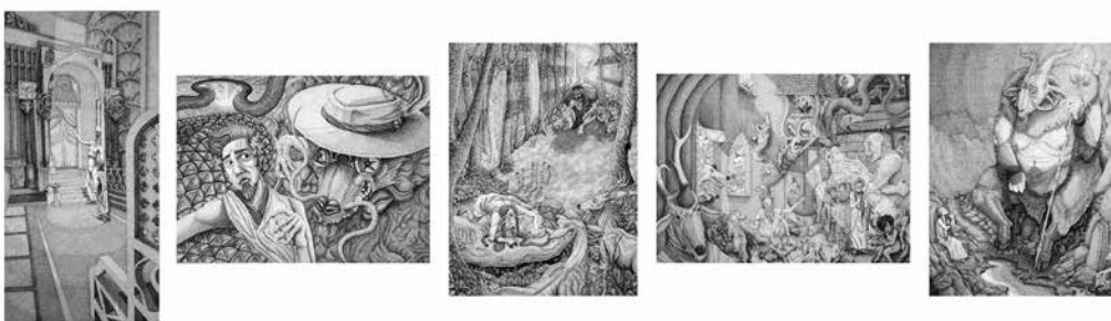
Bishop Taylor "Tales Of The Evangelist" (Series of 5)