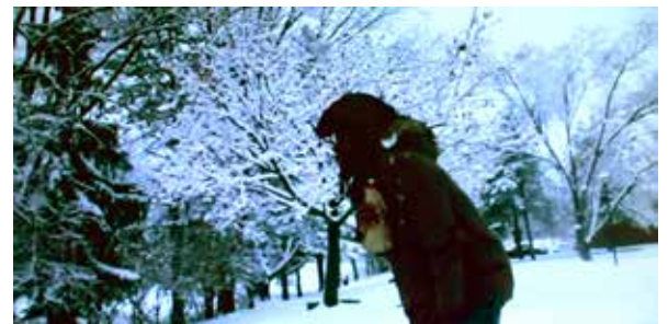
TaDareus Patterson "Helping out a Homeless" (video still)