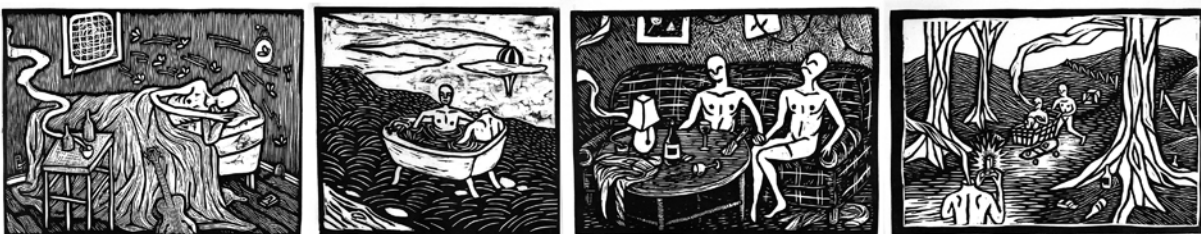
Simon Kingston "Prints" (Series of 5)