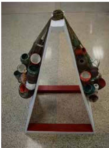
Emma Siefring "Cornucopia"