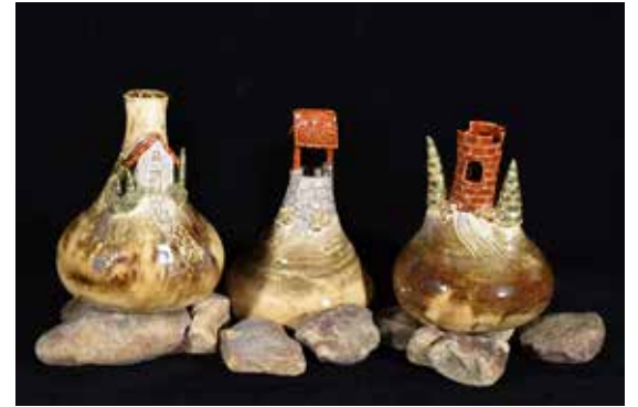
Sydney Pliska "Village"