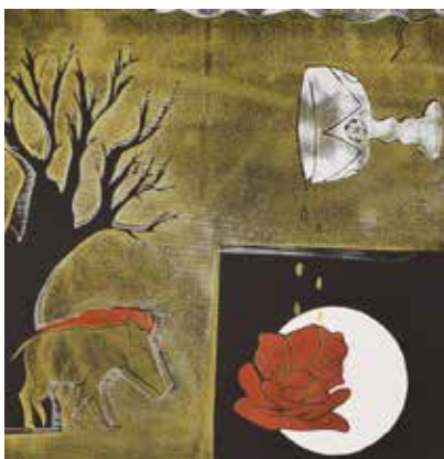
Anastasia Sprinkle "The Red Poppy"