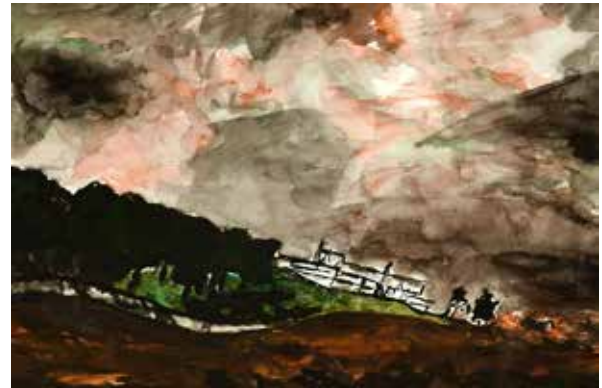
Abou Diomande "Ominous Evening"