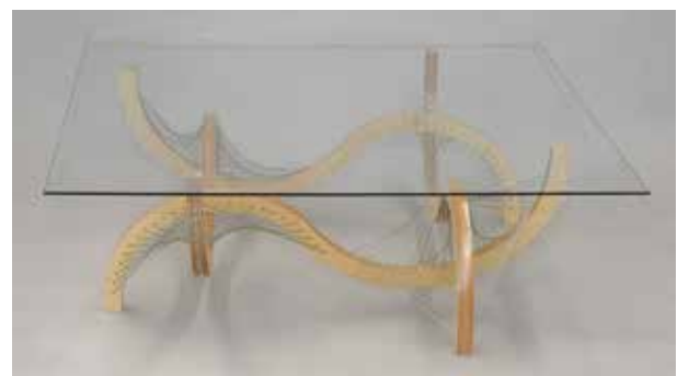
Troy Taylor "Zero Gravity Ode Robby Cuthbert"