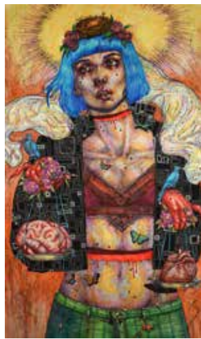
Brie Mullins "When In Doubt, Pinky Out"