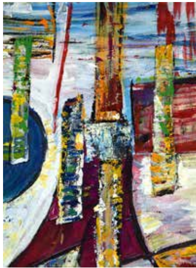
Sidney Caudill "Flomotion"