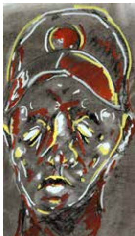
Nazyir McGowan "Charcoal Facepaint"