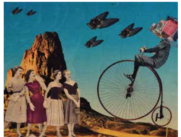
Erin Long "Industrial Revolution Women"