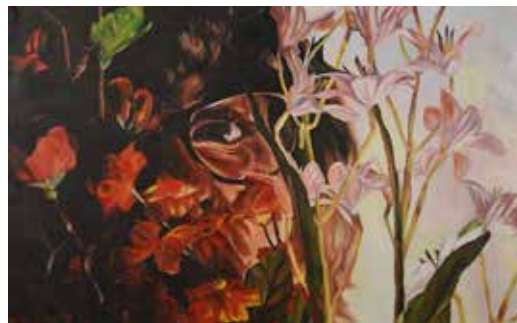
Sakurako Reed "Soph"