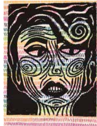
Leah Gombosch "Unamused"