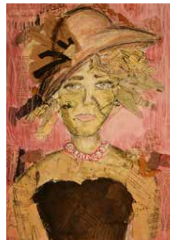
Olta Toska "Vogue"