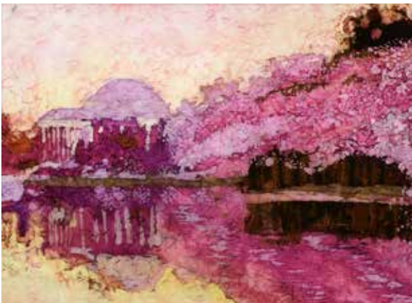
Isabella Getgey "701 East Basin"