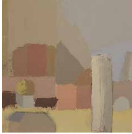
Isabella Camberos "Assortment"