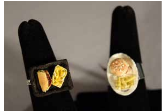
Emily Shonk "Tasty and Fashionable" (Series of 2)