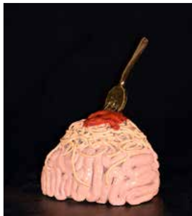
Jane Goble "Food For Thought"